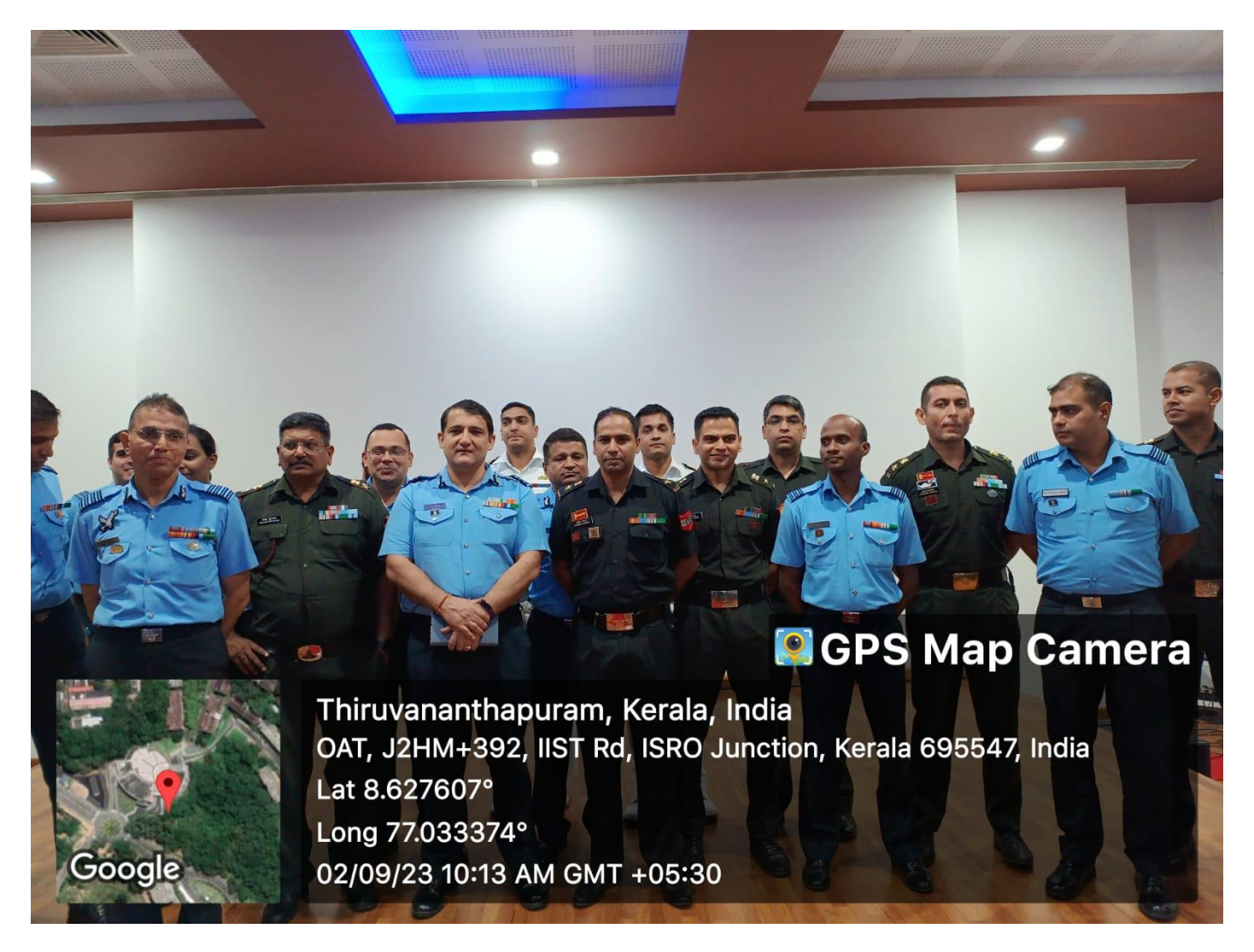
M/s SatSure Analytics team visit to IIST